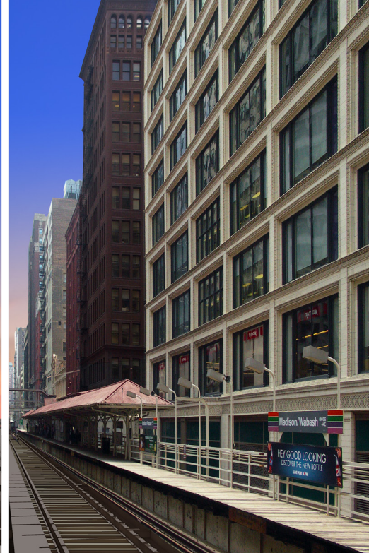
Existing Station Built in 1896

This project is the latest in a series of transit station rehabilitations that are part of Mayor Rahm Emanuel's commitment to improving public transportation in Chicago.