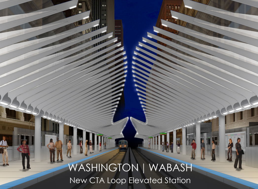
WASHINGTON | WABASH New CTA Loop Elevated Station

The concept of MOVEMENT is at the heart of the transit system. The CTA rail system is the thread that weaves through Chicago to connect the City of Neighborhoods with the Loop, its iconic landmarks, and the Lakefront parks.