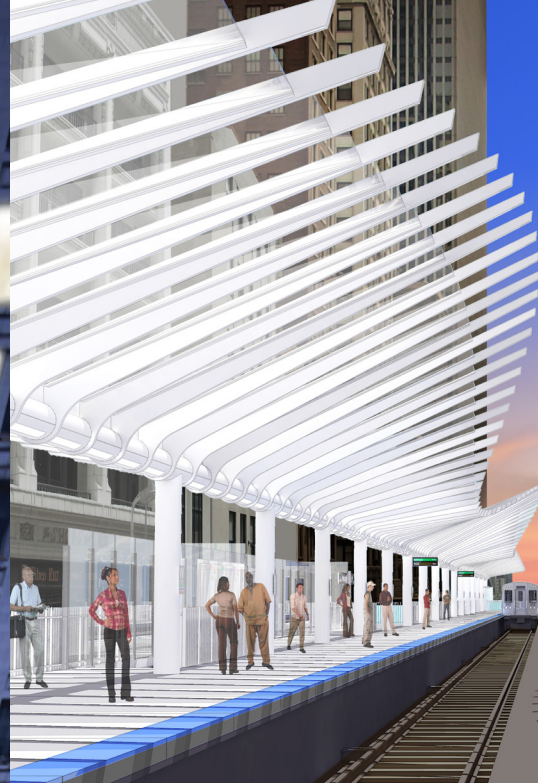
New Washington/Wabash Station