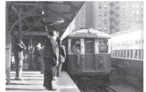
Historic Photo of the Randolph/Wabash Station

"Having world-class infrastructure is a key focus for any world-class city" - Mayor Emanuel