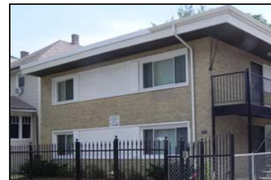
The award-winning rehabs of the 18-unit building at 5520 S. Prairie and the 8-unit property at 5521 W. Gladys were completed in 2011 using NSP grant funds.