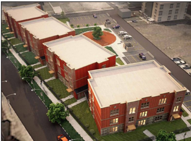
Harvest Homes will provide 36 affordable rental apartments in four walk-up buildings to be constructed at 3512-46 W. Fifth Avenue in the 28th Ward.

The City will provide $1 million in TIF funds and $1.2 million in Low Income Housing Tax Credits generating $10.7 million in equity for the project. Other funding sources include a $144,000 energy grant from the Illinois Department of Commerce and Economic Opportunity and a $97,000 grant from the Federal Home Loan Bank. The developer is Harvest Homes Apartments LP, a partnership between People’s Community Development Association of Chicago and The NHP Foundation.